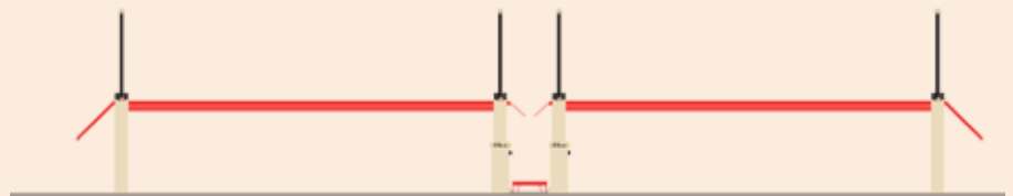
Tandem configuration, side view

The ST 4120 can be configured with two lifts connected in a tandem configuration which can be operated individually or simultaneously. Ideal for articulated buses or other longer vehicle combinations.