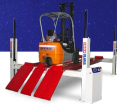
Optional third platforms available for 3-wheel fork lift trucks.

The Stertil-Koni ST 4120 hydraulic vehicle lift is suitable for the maintenance, service and repair of a wide range of vehicles, from light weight commercial vehicles, urban trucks, vans and buses to heavy duty commercial vehicles. With the optional third platform this mid range 4-Post lift is also ideal for 3-wheel forklift trucks.